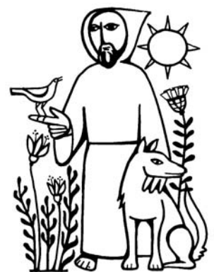
St. Francis, pray for us

Prayer of St. Francis Lord, make us instruments of your peace. Where there is hatred, let us sow love; where there is injury, pardon; where there is discord, union; where there is doubt, faith; where there is despair, hope; where there is darkness, light; where there is sadness, joy. Grant that we may not so much seek to be consoled as to console, to be understood as to understand; to be loved as to love. For it is in giving that we receive; it is in