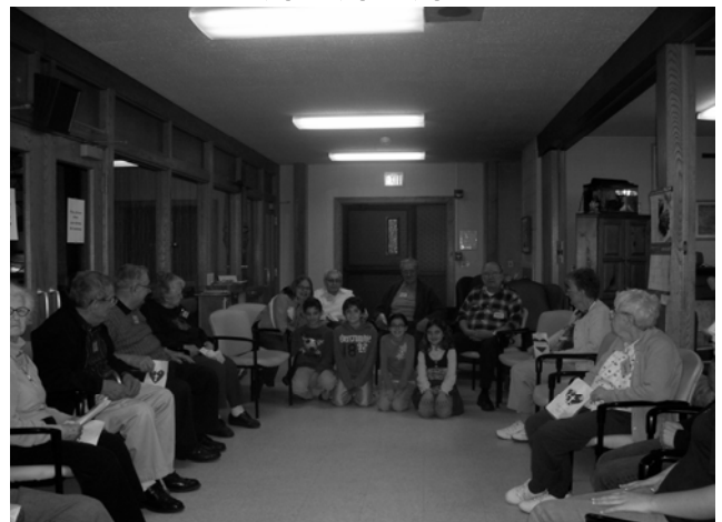
Great Room students presenting “Survival Kits” to the participants of St. Ann’s Home & Heart of Penfield.

In order to be selected for All-County, students have to prepare and play a solo and scales in front of an adjudicator. They are then given a sight-reading piece to play, which must be played on the spot without practice. Students are graded on specifics about how the solo, the scales and the sight reading piece were played. All students are ranked in order by their instrument, level of difficulty and score received. Students are then chosen to fill the seats in a band, an orchestra, and a choir for each of the 3 levels (Elementary, Jr. High, and High School). In March they will attend rehearsals on a Friday afternoon and Saturday morning with all the students selected from around Monroe County. They will give the performance that Saturday afternoon. Good luck, Incarnation musicians!!!